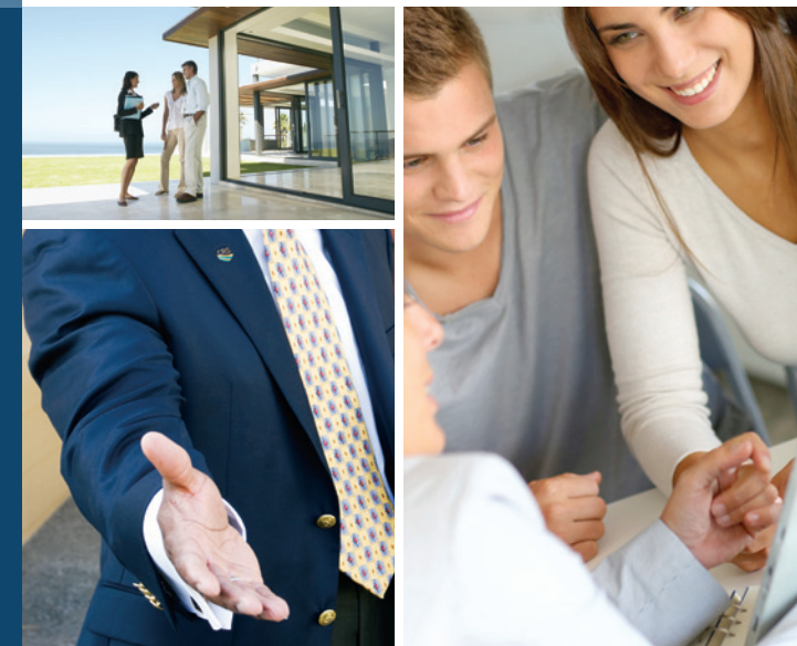
PHOTO Your Name REALTOR®, CRS Your company info www. ph: @

The Residential Real Estate Council is the largest not-for-profit affiliate of the National Association of REALTORS® (NAR). RRC supports 33,000 REALTOR® members with training and education, events, mentoring and networking opportunities. It awards the CRS Designation to experienced REALTORS® who have completed advanced professional training and demonstrated outstanding achievement in residential real estate.